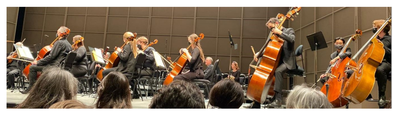
Regina Symphony Orchestra